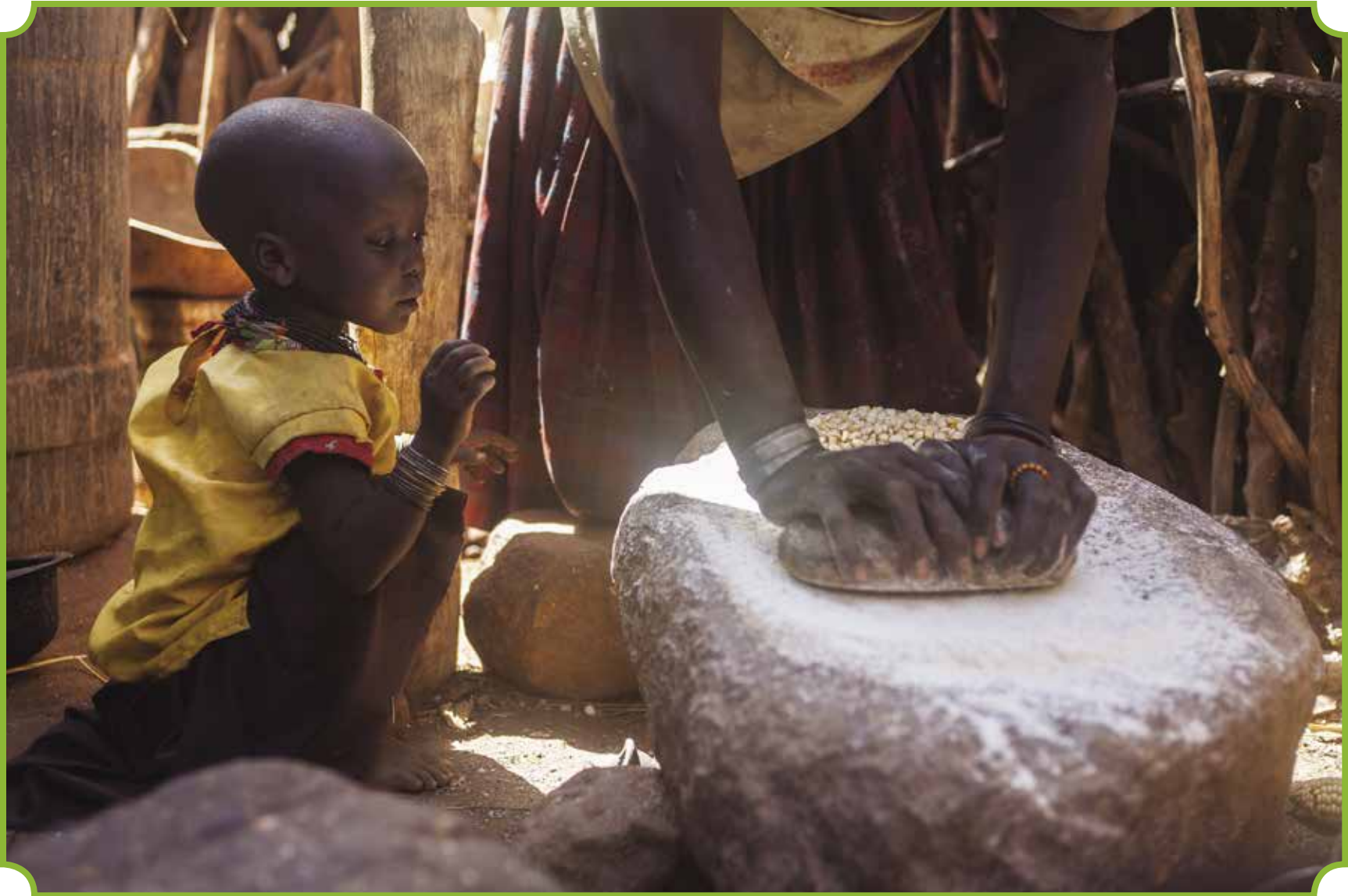
The Karamojong people are very poor and work very hard. Here a little boy watches his mother grind corn.