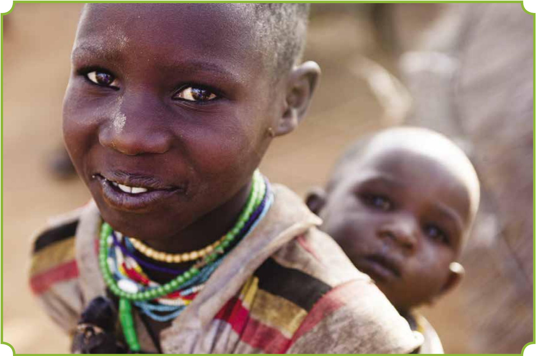
The Karamojong people wear colorful beads and clothes. They make almost all clothing and food by hand.