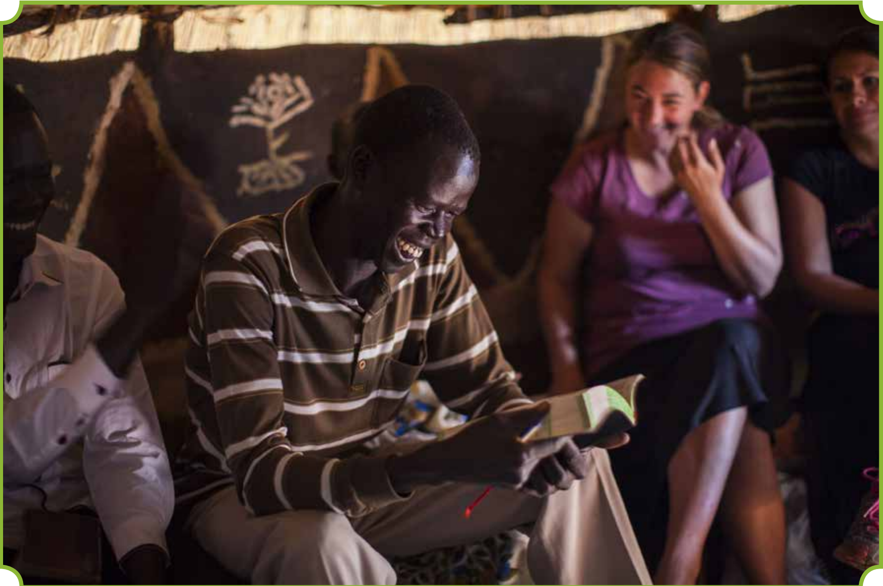
In South Sudan, this man enjoys studying the Bible with missionaries.